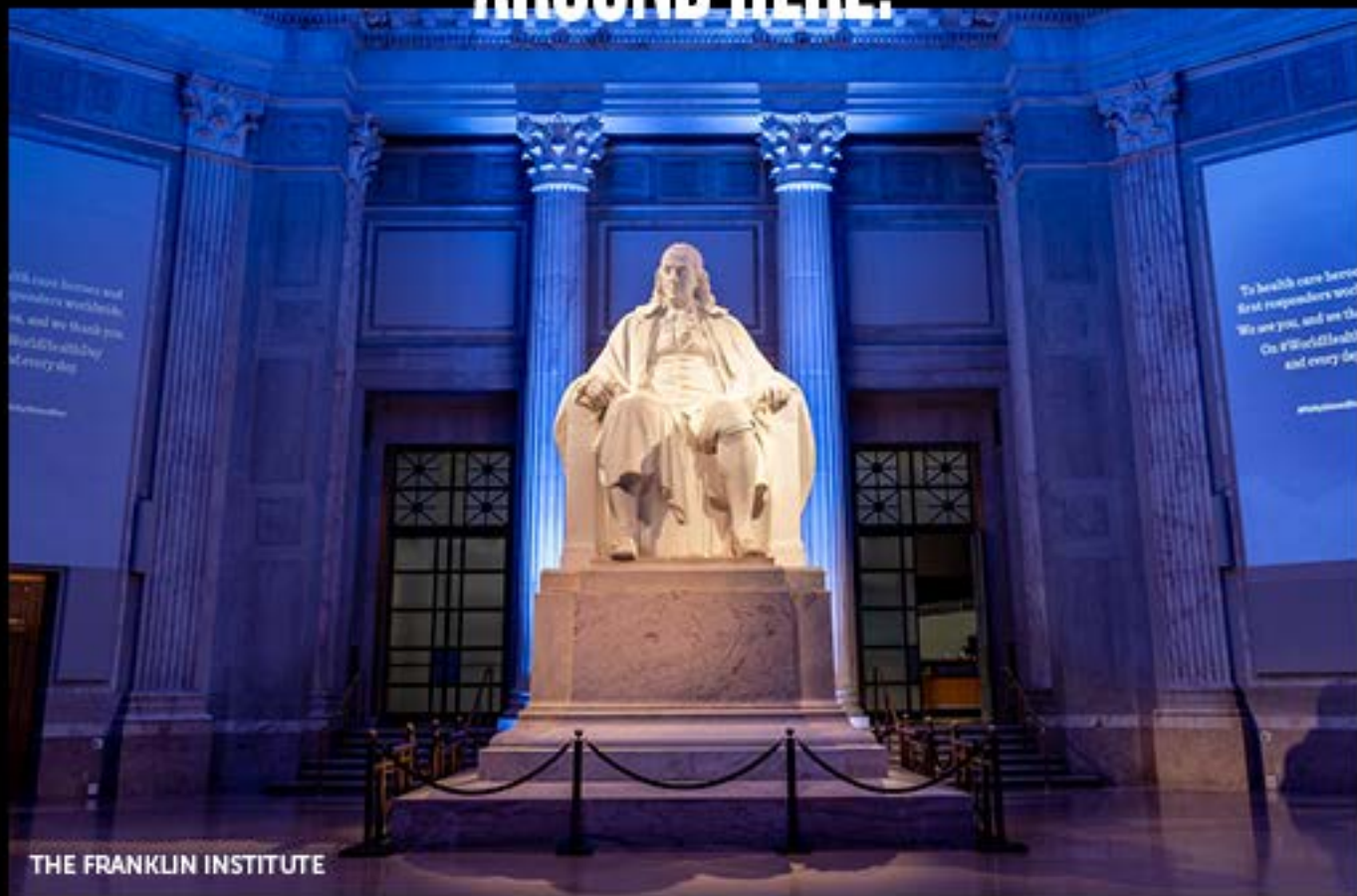
THE FRANKLIN INSTITUTE

YA KNOW, IN THE BIRTHPLACE OF MODERN DEMOCRACY AND ALL.